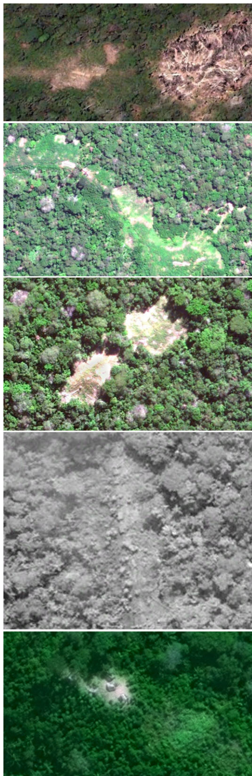
Figure 1. Satellite images of clearings and houses for sections of the five sites. From top to bottom are sites X, H, M, F1 and F2.

factors including the difficulties associated with clearing trees using traditional technologies, the degree of traditional housing and subsistence, and the age of communities. Traditionally, tree cutting was done with stone axes which is extremely time consuming [21–24]. FUNAI gave steel machetes and axes to isolated populations for decades (this practice has since been discontinued in this region), and they have