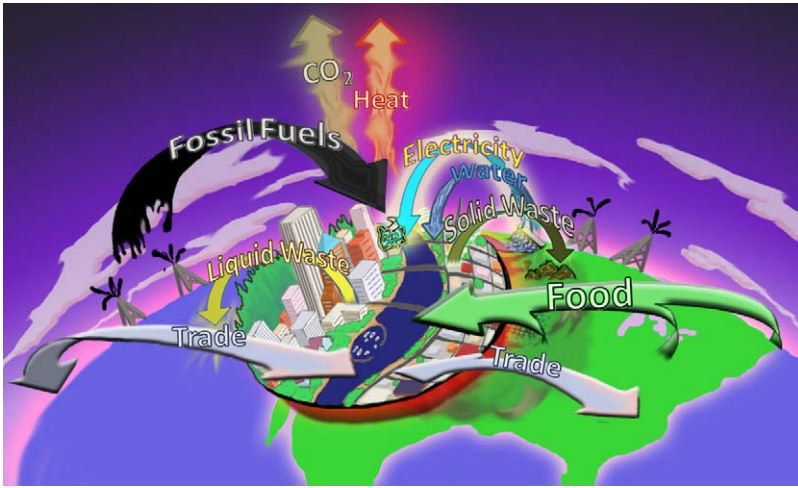
Figure 2. Pictorial illustration of important flows of resources into and wastes out of Portland, Oregon. This “most sustainable city in America” depends on exchanges with the local, regional, and global environments and economies in which it is embedded. doi:10.1371/journal.pbio.1001345.g002